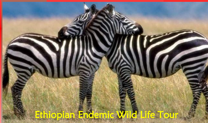
Ethiopian Endemic Wild Life Tour

Our Vehicles (COMBINE SAFETY AND COMFORT )